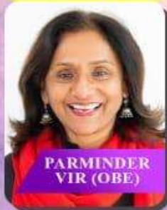
PARMINDER VIR (OBE)