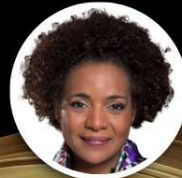
Hon. Michaëlle Jean P.C. C.C. C.M.M CD FRCPSC Social Justice Icon Award