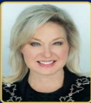
Bonnie Crombie Mayor of Mississauga