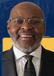
Mark Saunders Chief of Toronto Police, Retd.