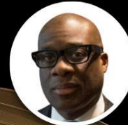
Justice Donald McLeod Nation Builders Award for Law & Justice