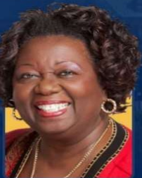
Hon. Jean Augustine PC CM OOnt CBE, Former MP