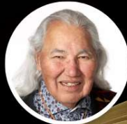
Senator Murray Sinclair C.C. OM MSC Nation Builders Award for National Unity & Harmony