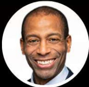
Hon. Greg Fergus P.C., M.P. Nation Builders Award for Inclusive Government and Politics