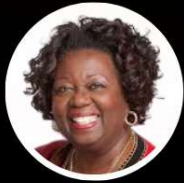
Hon. Dr. Jean Augustine P.C., C.M., O.Ont., C.B.E. Legacy Award

Hilton Toronto Airport Hotel Mississauga, Ontario, Canada