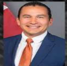
Wab Kinew Anishinaabe First Nations (MB)