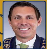
Patrick Brown Mayor of Brampton