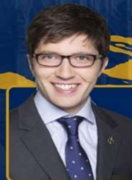
Garnett Genius MP & Human Rights Activist