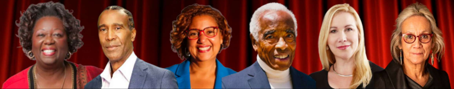
HON. JEAN AUGUSTINE

SATURDAY, OCTOBER 7, 2023 AT 5:30 PM (EST)