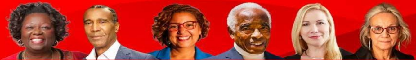
HON. JEAN AUGUSTINE