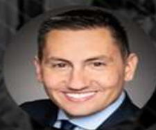
Jamie Schmale Member of Parliament